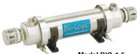
Model BIO-1.5 1.5 GPM

Purifiers are the ideal solution for an ever-growing range of water treatment applications.