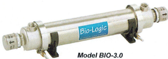
Model BIO-3.0 3.0 GPM