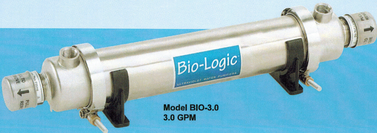
Model BIO-3.0 3.0 GPM