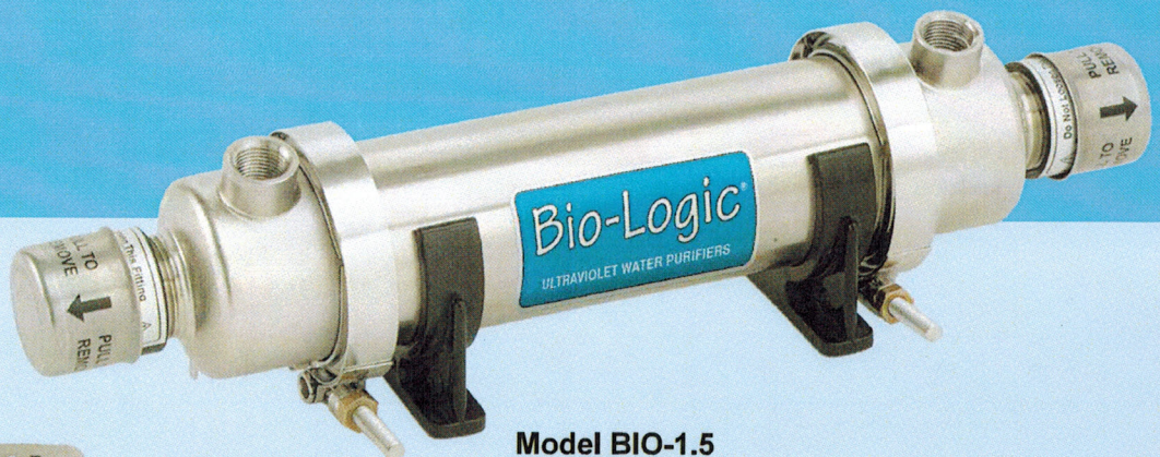
Model BIO-1.5 1.5 GPM