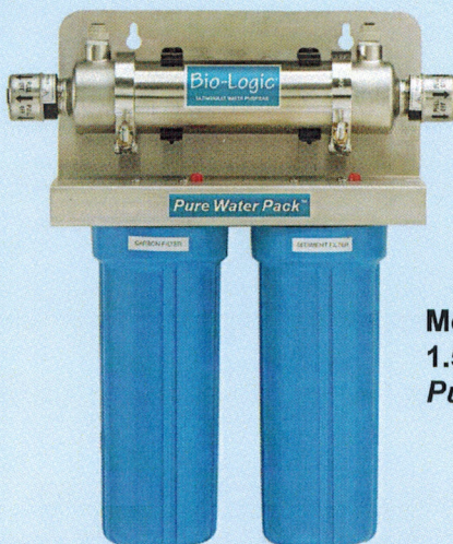
Model BIO-1.5 1.5 GPM with Pure Water Pack™