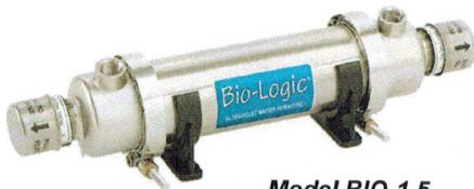
Model BIO-1.5 1.5 GPM

Bio-Logic® Ultraviolet Water Purifiers are the ideal solution for an ever-growing range of water treatment applications.