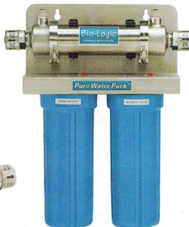
Model BIO-1.5 PWP 1.5 GPM